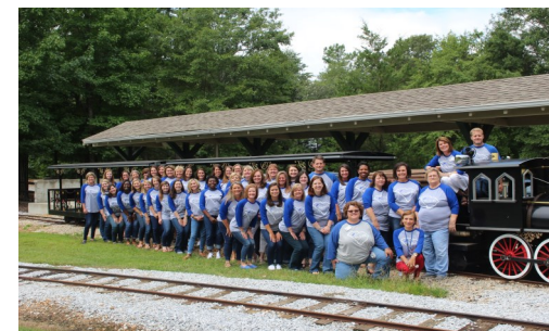
Report to the People

Our student achievement data is available in our South Carolina School Report Card and in our School Renewal plan located on our school website www.spart5.net/rves .