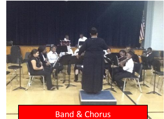
Band & Chorus