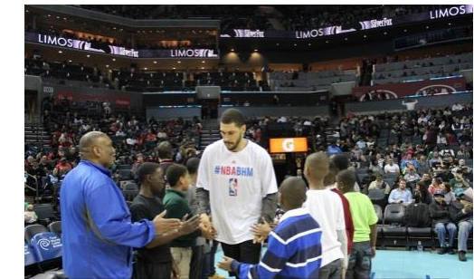
NBA Academic Incentive Trio