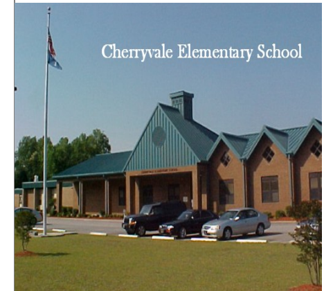
Cherryvale Elementary School

1420 Furman Drive Sumter, SC 29154 803-494-8200