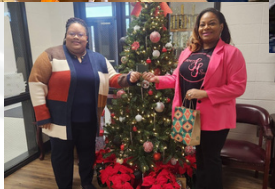
Community Partnership: Serenity Spa of Sumter