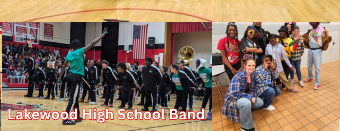
Lakewood High School Band