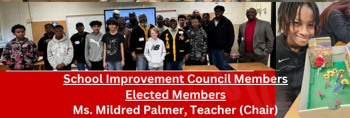
School Improvement Council Members Elected Members