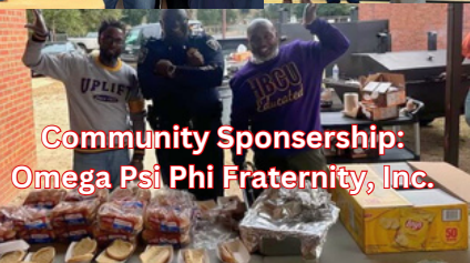
Community Sponsorship: Omega Psi Phi Fraternity, Inc.