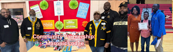
Community Partnership: Masonic Lodge