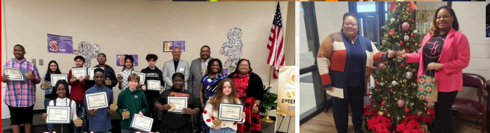
Chamber of Commerce Golden Apple Awards Recipients