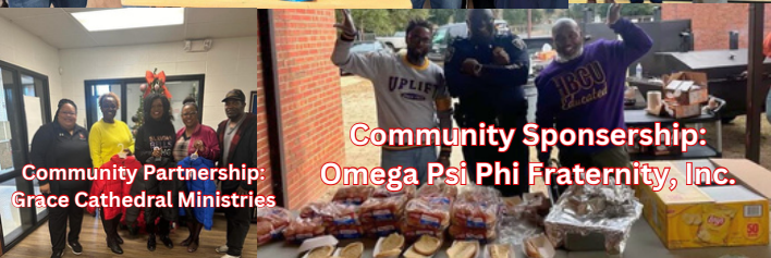
Community Partnership: Grace Cathedral Ministries