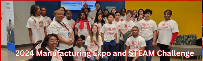
2024 Manufacturing Expo and STEAM Challenge