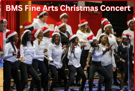
BMS Fine Arts Christmas Concert