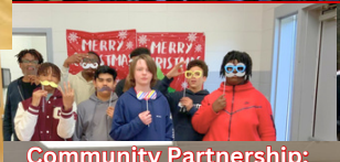
Community Partnership: Jehovah MBC