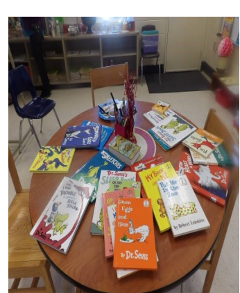
ELA and Mathematics are our Priority