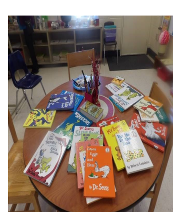
ELA and Mathematics are our Priority