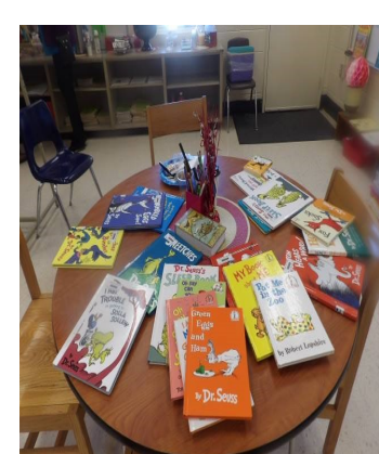
ELA and Mathematics are our Priority