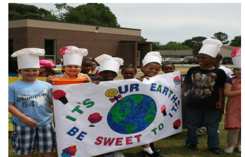
Poster made by students for the Earth Day Parade

For additional information or assistance, contact: S.C School Improvement Council USC College of Education Suite 001 Columbia, SC 29208 1-800-868-2232 http://sic.sc.gov