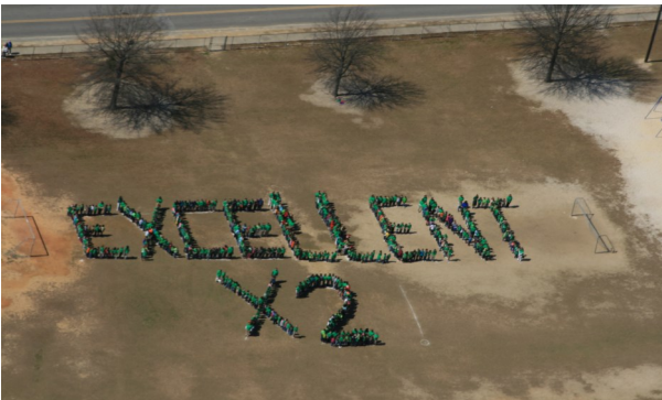
Arial Photo of Students Celebrating making EXCELLENT EXCELLENT on our Report Card for 2 years in a row.