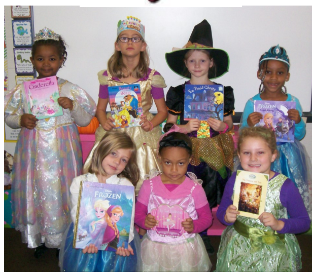
FIRST GRADE STUDENTS PARTICIPATING IN THE BOOK CHARACTER PARADE