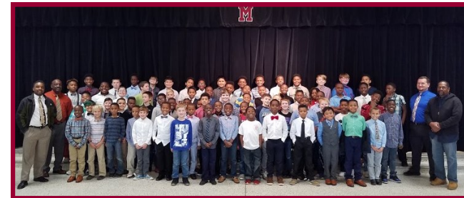
Millwood Men of Distinction

The School Improvement Council for Millwood Elementary School will increase student support by continuing and developing groups for boys ( Men of Distinction - MODS ) and for girls ( Girls Educated and Motivated by Success - GEMS ). Actions include monthly meetings, opportunities for student leadership, opportunities for student collaboration, completing service projects, and mentoring for students in the program as needed.