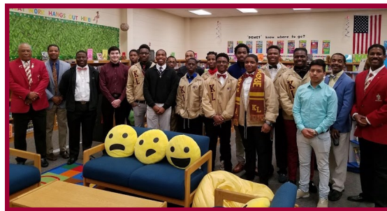
Kappa League of Sumter