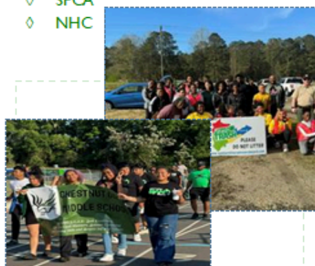
Relay for Life/ Stash the Trash