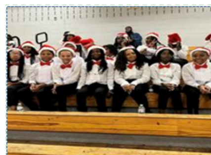
Black History Month Program/ Winter Concert

MOTTO Seek Excellence. Opt to Use Manners. Activate Listening and Learning Skills. Respect Self and Others.