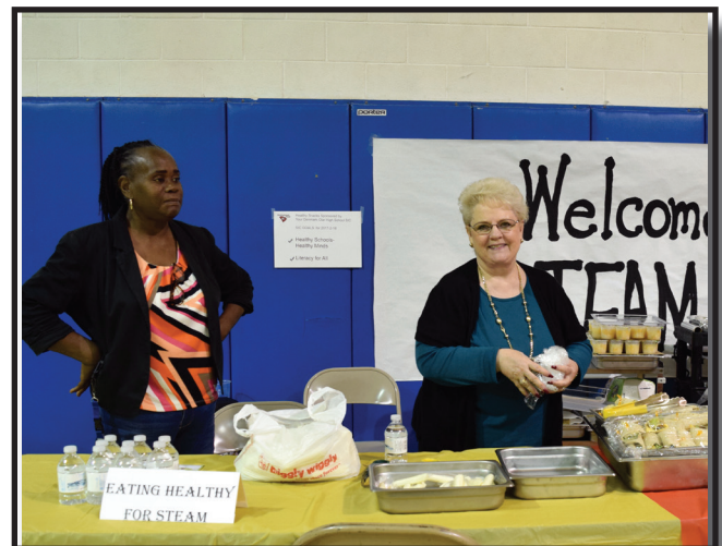
The SIC STEAM Night Table

Each year the South Carolina SIC holds a meeting to provide legislative updates and recognize outstanding local organizations.