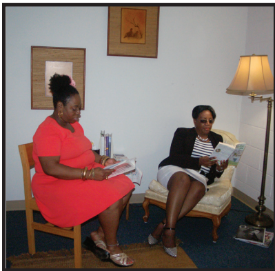
The Denmark-Olar High School Quiet room