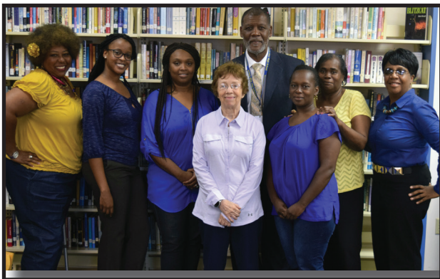
The 2017-18 Denmark-Olar High School SIC

The SIC is part of the school and district strategic planning process. The SIC advises the school principal. SIC representatives serve on school and district planning committees. The SIC does not raise funds, but it works closely with other groups that seek out funding sources. Your SIC is open to all parents, students, teachers, and community members.