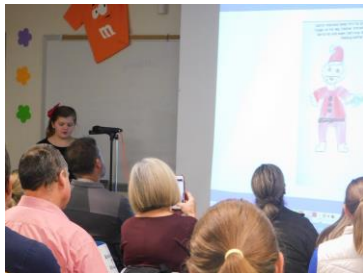
Goal 1: Increase Student Achievement