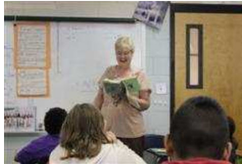
Goal 2: Teacher/Administrator Quality

All classrooms are included with the latest technology of Promethean Boards, document cameras, and classroom computers.