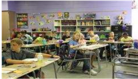
Goal 1: Increase Student Achievement