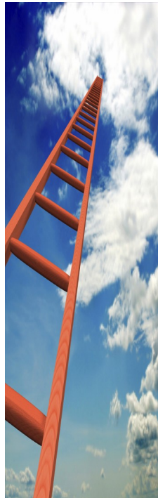
Language Arts % Meet