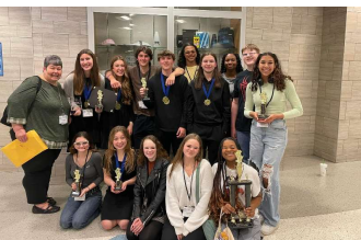
Rock Hill High School Theatre Department