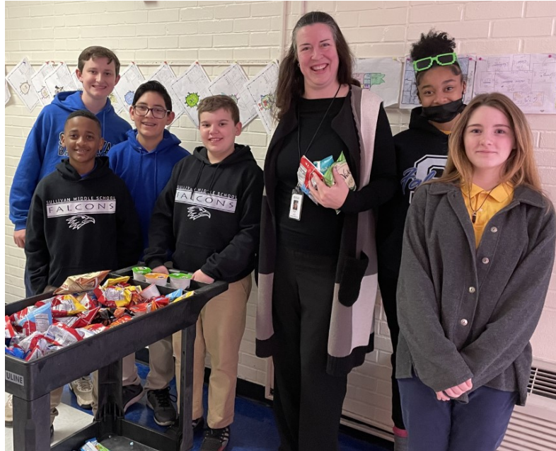
The Beta Club stayed active encouraging and motivating kids to give back to their community all year!