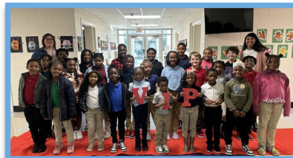
Very Improved Players (VIP)