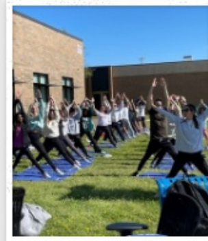
YOGA ON THE GREEN