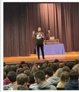
SWARM WEEK GUEST SPEAKER

Through the efforts of the Fort Mill High Guidance Department, students were able to participate and focus on their well-being. The event was a success and FMHS looks for SWARM week to be a part of the school culture for years to come.