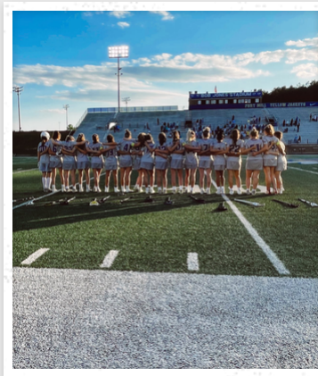
2021 FMHS GIRLS LAX BEFORE STATE PLAYOFF MATCH