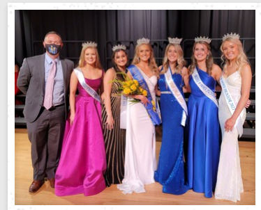
2021 MISS FMHS PAGEANT