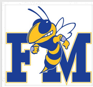
The Logo of FMHS