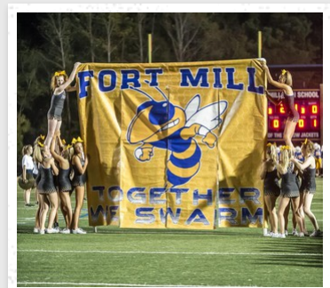
Together We Swarm