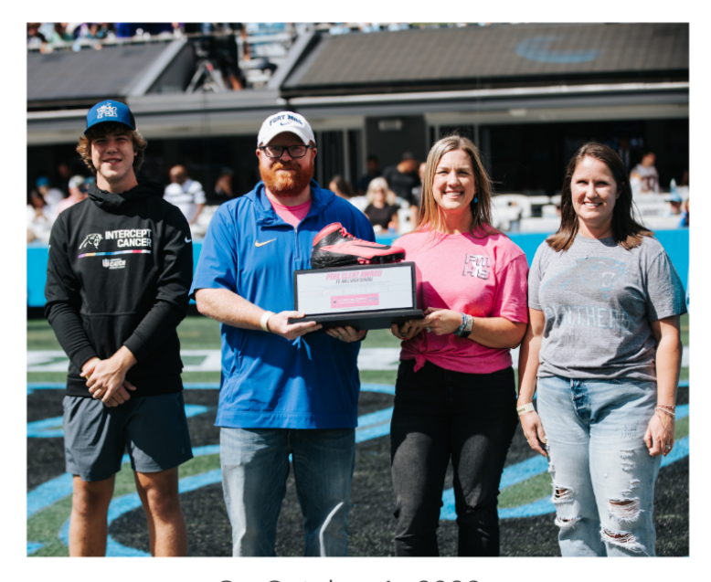
On October 1, 2023, Fort Mill High School Pink Out was recognized during the Carolina Panthers annual Crucial Catch game as the #1 fundraising high school in South Carolina for 2022.

In addition to the school's recognition, local breast cancer survivors participated in a halftime presentation to celebrate their survivorship.