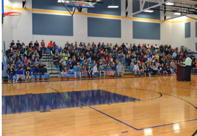
Future Falcon Night

Rock 'n Read Family Literacy Night: This was a first for us, and it was a huge success! This evening was an opportunity for our school to celebrate literacy and to show our families and community how we use literacy throughout our building. We had many students present and perform at this event which drew approximately 500 people. We are in the discussion phase for next year's program.