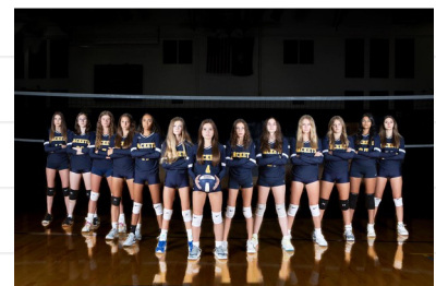
8th Girls Volleyball Team