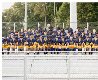
7th & 8th Football Team