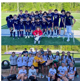
7th & 8th Boys and Girls Soccer Teams

The Spring Sports season always brings with it possible rain delays and more than one game a week due to scheduling our teams showed up to bring the SWARM once again. Boys and Girls soccer teams showed sportsmanship and pride to our school as they played against some competitive teams this year both making it into the semi-finals. The baseball team showed great sportsmanship during the season being recognized for it by several coaches and parents. Boys and Girls Track brought the sting as we broke several school and district records.