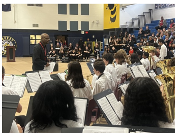
Band and Chorus Concert

The Step Team watched the Syncopated Ladies – a female tap dance troupe from Los Angeles, CA in Charlotte, NC at the Knight Theater.