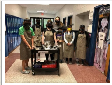
Bitty & Beau's Coffee Cart