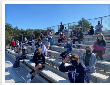
Socially distanced Pep Rally