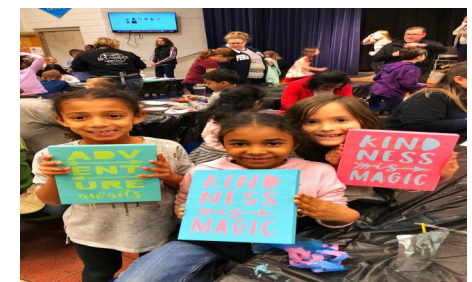
Springfield Elementary Colts