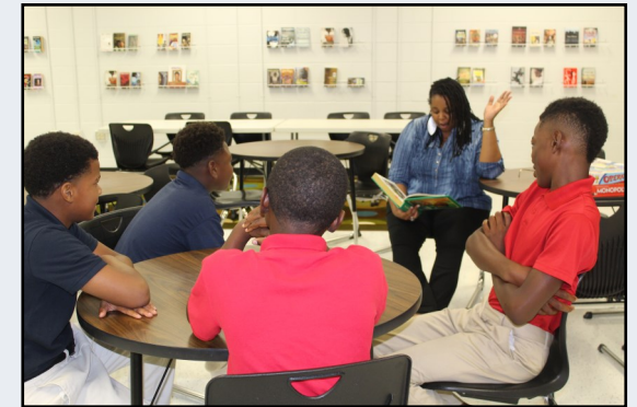
Pictured above: Students listen attentively as our Social Worker shares an entertaining story with them.

Students made significant growth on the spring 2018 MAP assessment and several exceeded their goal by more than 20 points. We are extremely proud of their efforts and we believe goal setting and teacher motivation resulted in these gains.