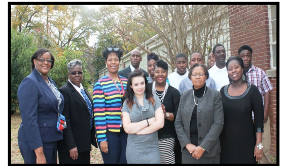
Pictured below: Students and staff during American Education Week celebration.