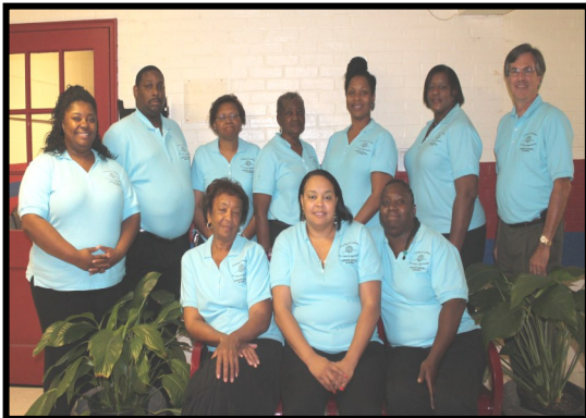
Pictured above: GOA teachers and staff members after the Back to School Rally in August.