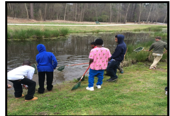
Pictured above: Students on a science-based field study at Saluda Shoals Park where they fished for tadpoles and crawfish as part of a biodiversity lesson.