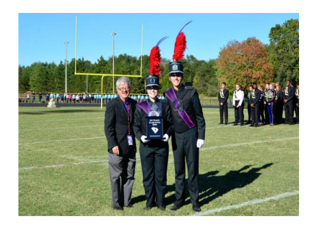
Community Service and Involvement