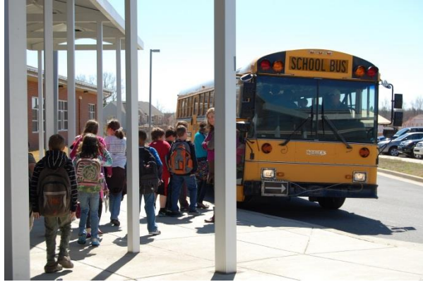
Ending another amazing year at IHES, May 2013