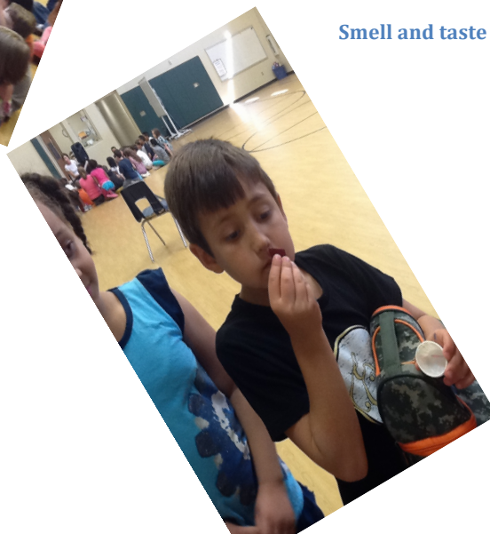
Smell and taste go together.