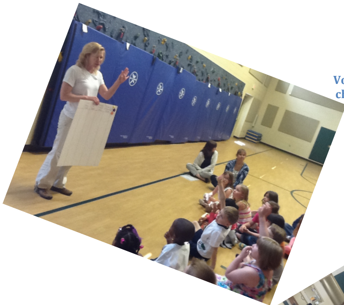
Volunteers challenge students to make healthy choices

Because our parents and staff feel so strongly about physical health, we have modified our fund raising efforts to include a spring fun run. This run is a culminating event celebrating months of emphasis on exercise and healthy eating. This team begins working together in the fall to make this possible. Over 2,000 hours of volunteer time is given by this group to coordinate and plan meaningful events for our school around Fun Run. So far we have raised over 28,000 with our Fun Run this year.