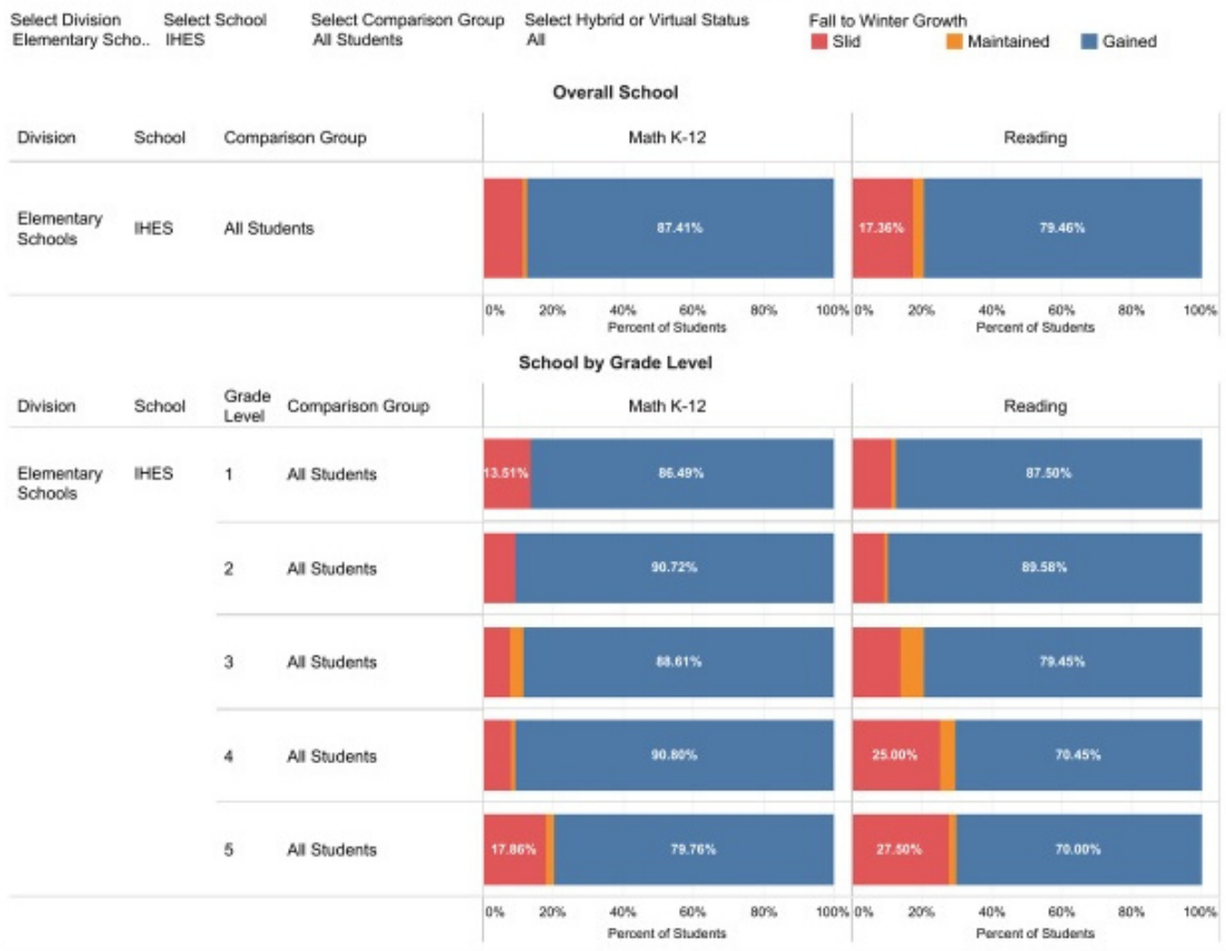
Fall 2020 to Winter 2020 Growth Category by School