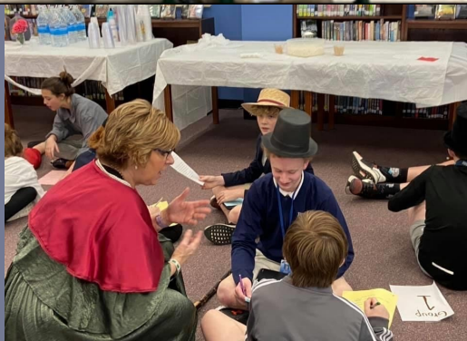
7th grade ELA teachers working with students during a simulation activity.