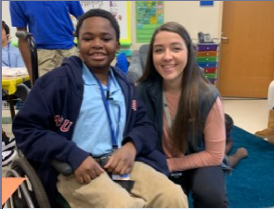
Students in a class hosted “Friendsgiving” to show their teachers appreciation.