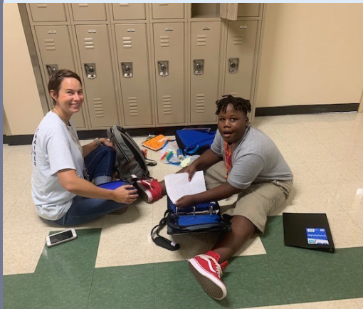
6th grade counselor helping a student with organization.