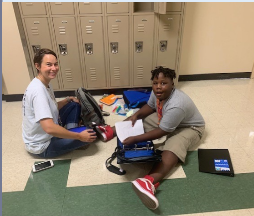
6th grade counselor helping a student with organization.