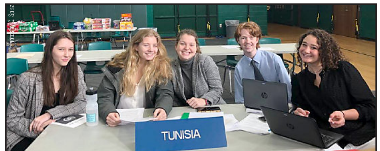
Model UN received “Best Delegation”