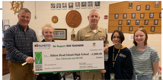
FIVE HIIHS TEACHERS WIN THE BRIGHT IDEAS GRANT.