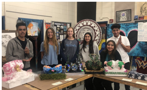
ART STUDENTS CREATED ONE-OF-A-KIND BRA DESIGNS FOR BREAST CANCER AWARENESS MONTH