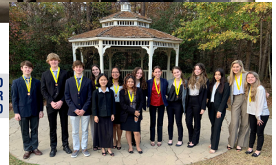
FALL FINISHERS WERE CELEBRATED FOR MEETING EARLY GRADUATION REQUIREMENTS