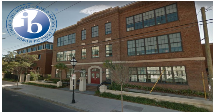
Buist Academy for Advanced Studies

In South Carolina, a School Improvement Council is an advisory council to the principal and school on issues related to school improvement. By law, every K-12 public school in South Carolina must have an SIC that is made up of parent, teacher, student (grades 9-12), and community member representatives.