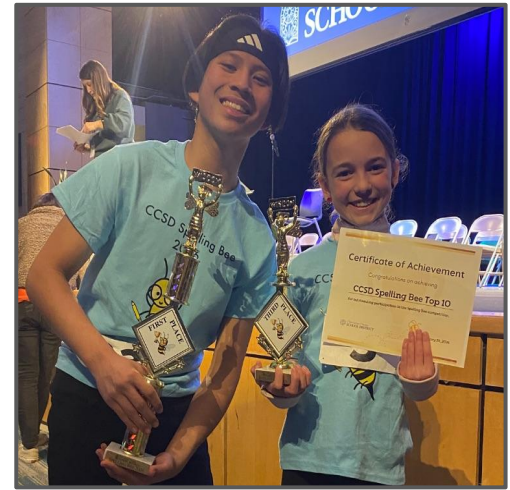
Spelling Bee 1st & 3rd Place Winners