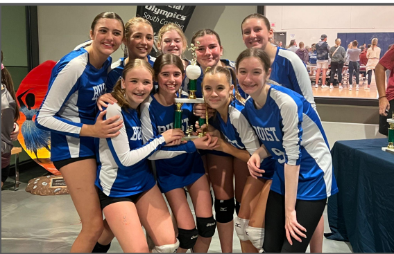
8th Grade Girls Volleyball Champions