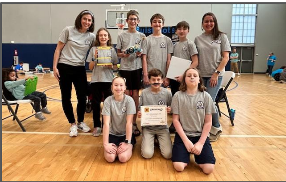
Buist LegoRobotics Team