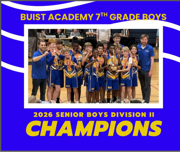
7th Grade Basketball Champions