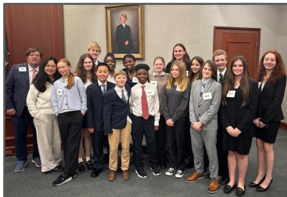
Buist Mock Trial Team