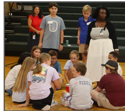
6th Grade Summer Orientation