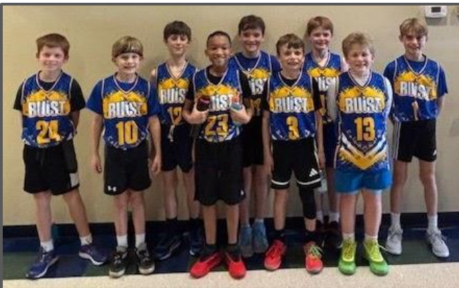
3rd Grade Basketball Champions