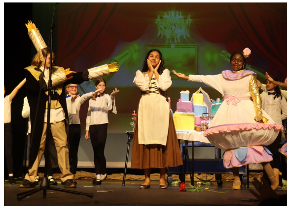
Beauty and The Beast Musical