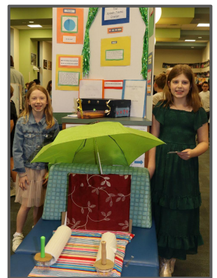
4th Grade Invention Convention