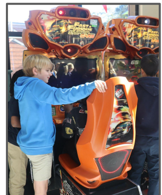
Arcade Day Recognition Celebration