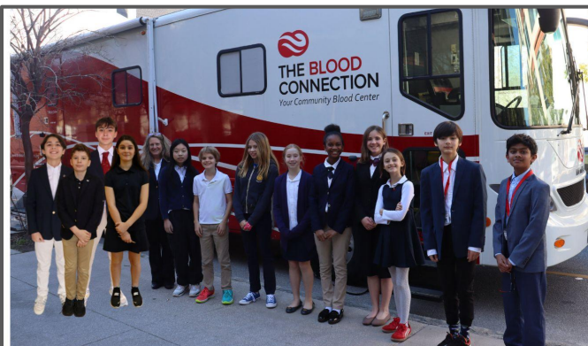
Buist HOSA Club Blood Drive