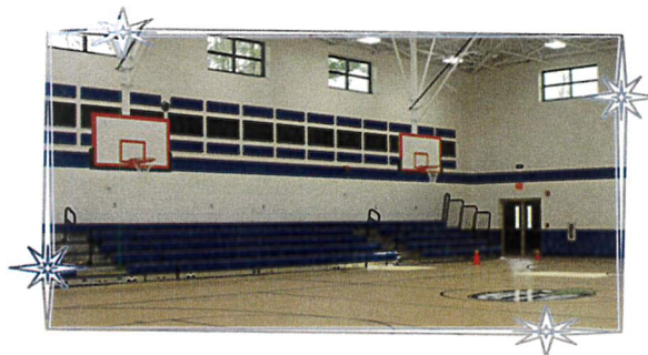
WIS Dedicated Our New Gym On January 28, 2020