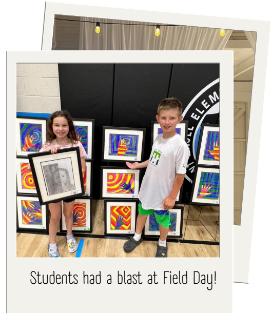
Students had a blast at Field Day!

This year, our 18 staff members have attended professional development that relate to Professional Communities, Behavior Solutions and IXL implementation for students.