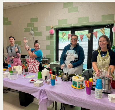
PKES PTO Board

Pleasant Knoll Elementary is rated in the top 2% of elementary schools in academic achievement and student growth. Pleasant Knoll received an Excellent rating on their 2023-2023 school report and an Excellent rating in every measure. You can click here for the full PKES State report card.