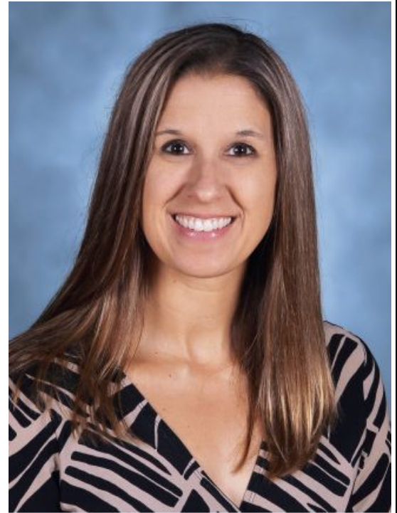
8th Grade ELA Teacher 2017-2018