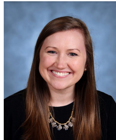
7th Grade Math Teacher