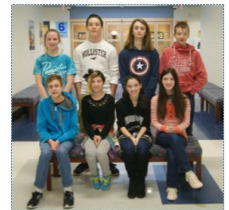
Congratulations to our All-County Band Winners!