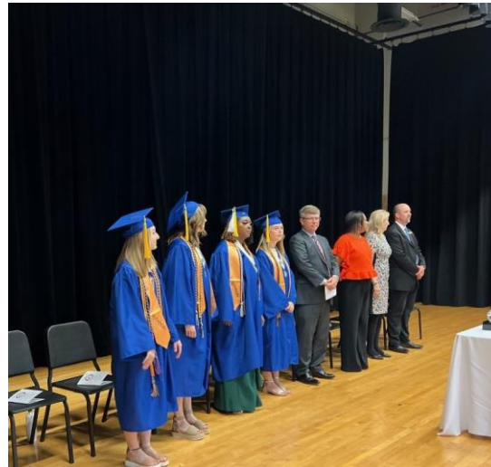
Our Governing Board (SIC Council): Voting Members