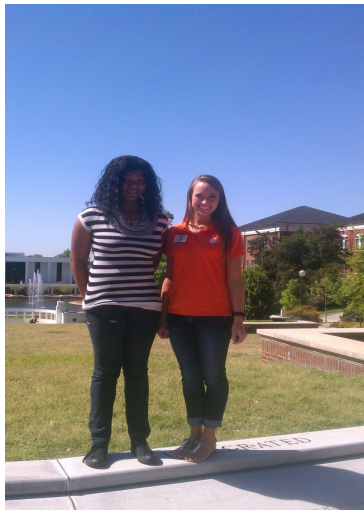
A charter student with our tour guide at a recent trip to Clemson University.