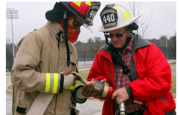
FIREFIGHTING IS ONE OF THE CAREER & TECHNICAL COURSES OFFERED. OTHERS INCLUDE BUSINESS, ENGINEERING, COMPUTER SCIENCE, SPORTS MEDICINE, HEALTH SCIENCE, AND DIGITAL ART.

Westwood High, in partnership with our parents and community, engages and motivates students to develop 21st century skills, while producing responsible citizens who are prepared for future success.