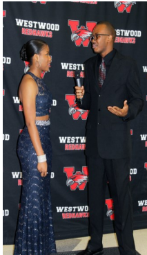
REDHAWK TV INTERVIEWS ATHLETES ARRIVING FOR THE WESTYS AWARDS.