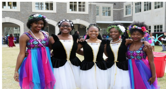
THE SCHOOL HOLDS A RENAISSANCE FAIRE IN APRIL.