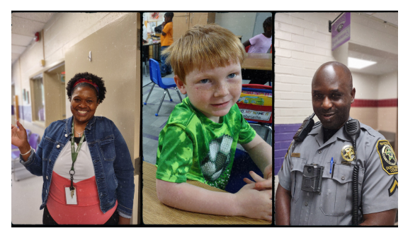
Read Across America