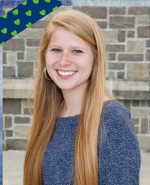
TEACHER OF THE YEAR DISTRICT HONOR ROLL TEACHER

Leadership opportunities abound in Titan Country! Students can participate in and lead various clubs hosted by our active Parent Teacher Organization or staff members. While these vary by year, during the 2023-2024 school year, these include the following: Chess Club, Volleyball, Writing Club, Girls on the Run, Let Me Run, Robotics Club, Battle of the Books (current District Champs), and IROCC House Ambassadors. Additionally, our Collective Leadership Team fosters collaboration through Classroom Connections, pairing homerooms from different grades for projects and activities. These enriching experiences create connections and foster exceptionalism within our student body.