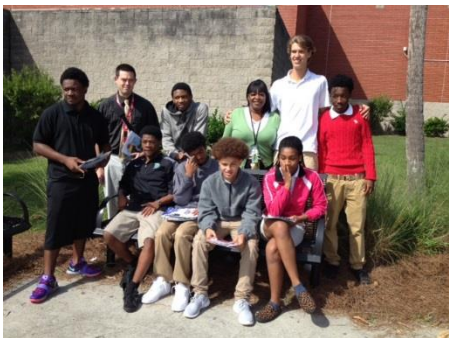
College Fair Fall 2015

We empower students to develop skills necessary for success in a global society. Right Choice School focuses on developing the “whole student” by emphasizing transferable skills leading to academic success and productive citizenship.