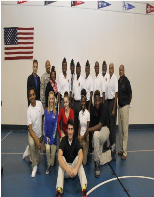
Veteran's Day Activities