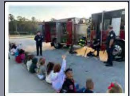
The Guidance Department provided Touch A Truck for grades K-2