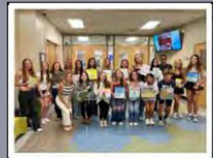
Carolina Park Elementary was happy to welcome Wando's Book Buddies club