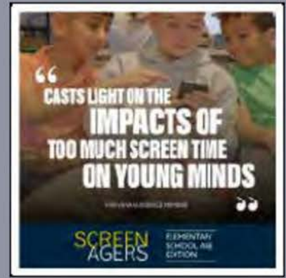
Screenagers Presentation and SIC roundtable discussion for upcoming initiatives.

Carolina Park Elementary was proud to partner with Wando High School and various CCSD schools of Mt. Pleasant to sponsor a presentation of Screenagers on March 31st. The event provided an informational film about our young learners' use of screens (cellphones, online games, etc.) and the importance of supporting the mental health and well-being of our youth. Audience members had an opportunity to engage with a panel of experts who shared their expertise about screens, resources, and tips on how we can balance the use of screens in our daily lives. We are excited to share ways we are implementing mindfulness to our technology usage, whether this be through social media, cell phone usage, gaming, and television. -As a student body, we will pledge on a monthly basis with rotating themes each month to limit screen time usage. -During the week of April 28th, we will kick it off by pledging no screen time during dinner. This can be tailored to your family's household.