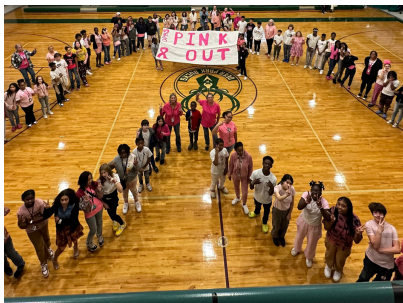
Deer Park Middle School's Pink Out for Breast Cancer Awareness