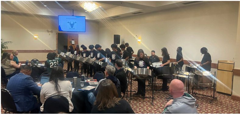
DPM Steel Drums perform at the CCSD Principal's Meeting.