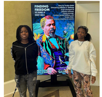
Field trips to Gaillard Auditorium's Finding Freedom performance and College of Charleston's STEM Day.