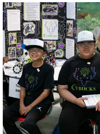
Deer Park MS Robotics Team "CyBucks" in competition.