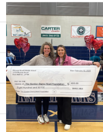
Hoops for Heart