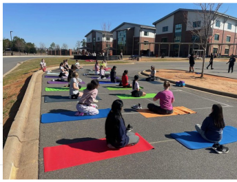
Yoga at Blacktop