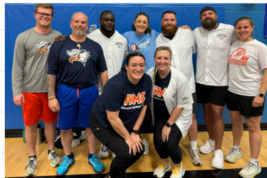
Polar Plunge Dodgeball