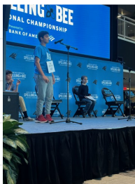
Regional Spelling Bee