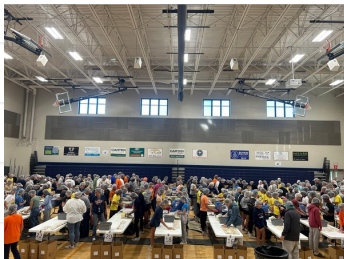
Servants with a Heart

We also kicked off our first annual SOAR (Support, Optimism, Act with Kindness, Resilience) Week at PKMS! This included therapy dog visits, wellness popups, staff zumba, yoga at blacktop, and a motivational speaker. We also encouraged extra acts of kindness throughout the week! It was a great success and we are looking forward to growing this week in the future!